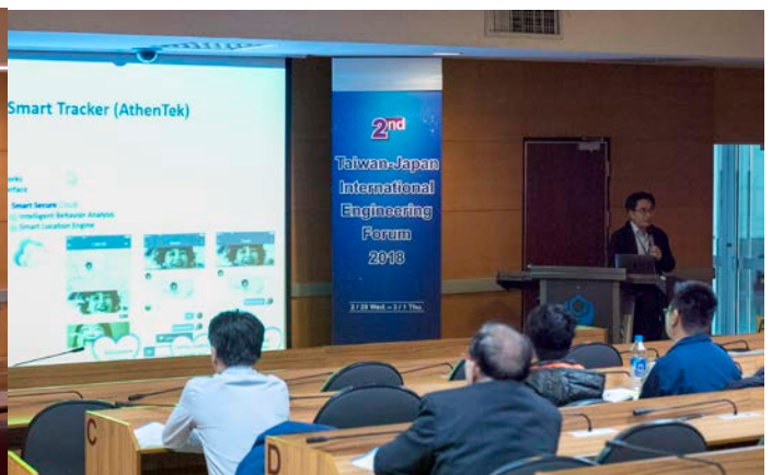
Young Faculty Session