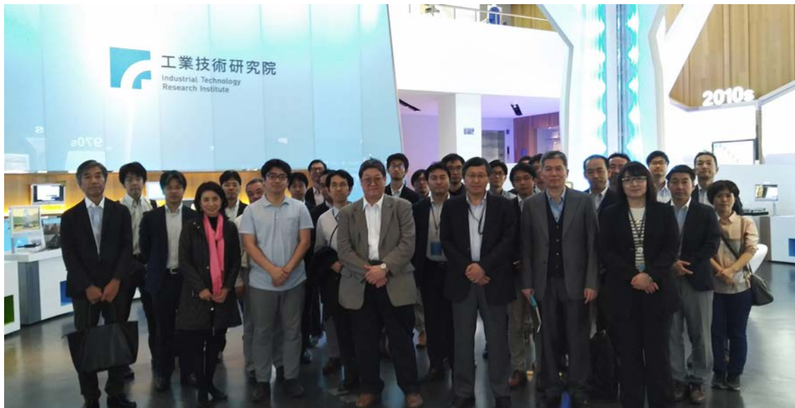
Technical Tour (ITRI)