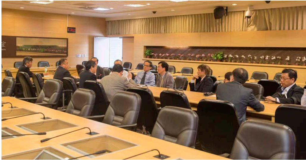
Discussion on educational programs with NTUST