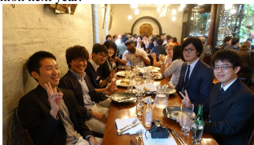
Final social gathering