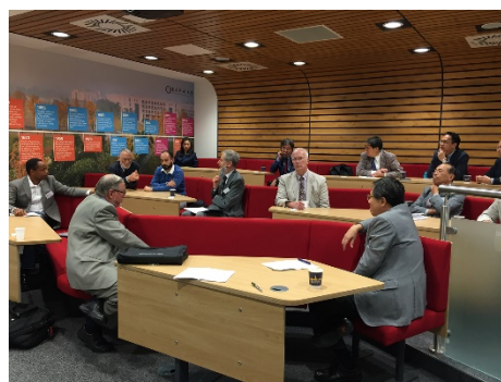
Round table discussion