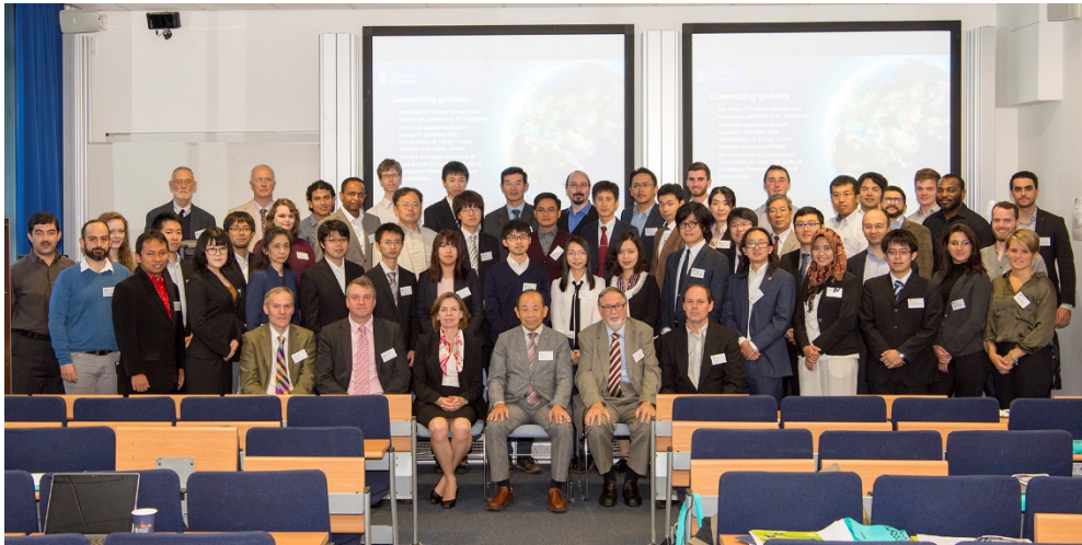
Participants of UKJEEL Workshop at University of Glasgow