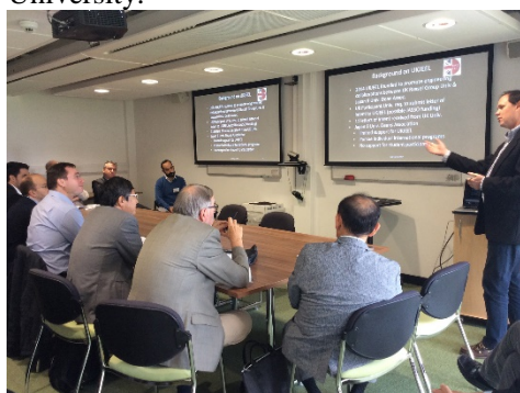
Discussion on UKJEE

In the business meeting on Friday, future of UKJEEL was discussed. Next year UKJEEL will be hosted by Kyushu University.