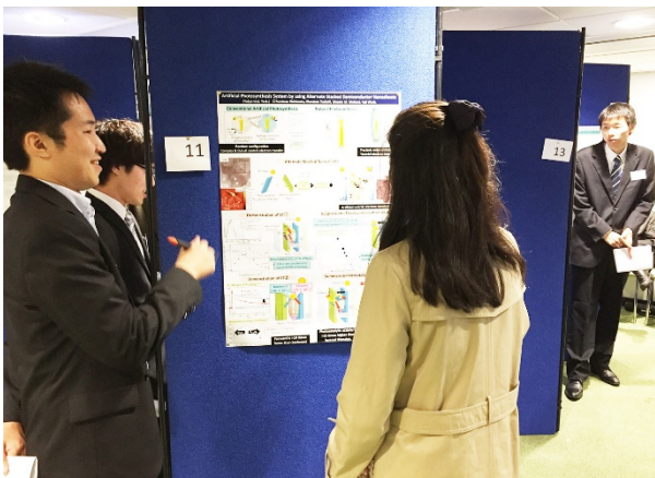
Students' poster session

Students made 3-minute shotgun presentations and then poster presentations on 7 September. Then they formed 5 groups and had group discussion on "Sustainable Integrated Renewable Energy Systems for the Future" to propose how we can reduce carbon dioxide emissions. Discussion results were presented on 8 September.