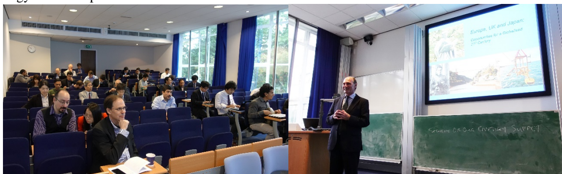
Lecture by guest speaker