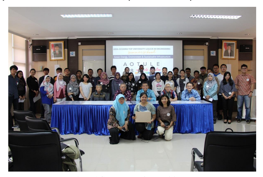
Figure 1 Group photo of all participants

I participate in AOTULE Sumer Program 2018 at Institut Teknologi Bandung (ITB) in Indonesia from August 1 to August 18. The theme of this program is Green Energy, Environment & Sustainable Infrastructure. This theme is not my specialty. But, I can understand the theme due to detailed explanation. And also, I understand the necessity of sustainable society.