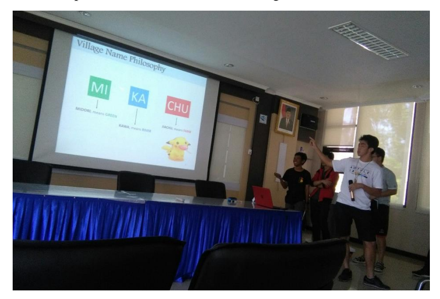
Figure 5 Giving a presentation

In the final day, I gave a presentation which I discuss with my group member. The topic is to make sustainable town. The theme decided only the framework, so there were many ideas depending on groups. In my group, there are three theme; green, river and farm. In our village, do micro hydro power with river and make many crops to export. Name of our village is "Mikachu". Combined with famous character, the reputation from other students was good.