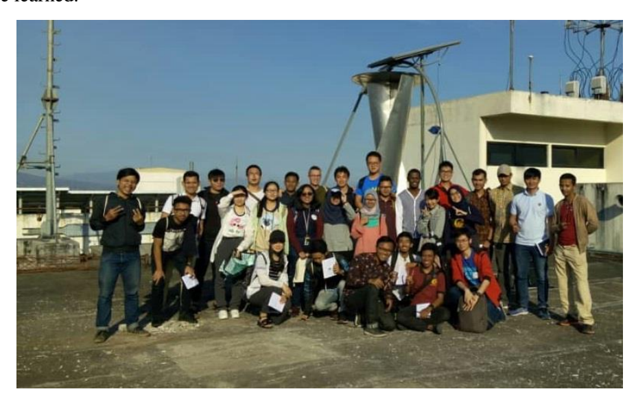
Figure 3 Equipment of wind turbine

There were 13 lectures about Green Energy, Environment & Sustainable Infrastructure in this project; Introduction to Geothermal Energy, Topic on Wastewater Treatment for Electricity, Topic on Natural Coastal Protection and so on. Lectures are basically divided into two parts. In the first part, participants take a lecture by professor or doctor student about 90 minutes. After coffee break, in the two part we visit laboratories and watch equipment. The lectures include basic content. So, I was able to understand from the beginning. I could have an interest to sustainable society. I would like to make the most of what I have learned.