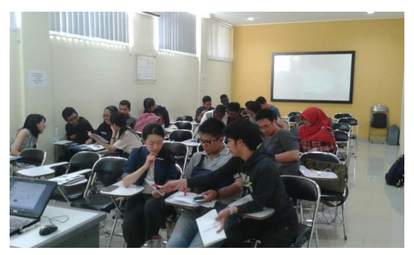
Figure 4 Lecture of Indonesian language

In this program, we took lecture three times about Indonesian Language. In the class, we studied basics of Indonesian language such as number and self-introduction. Not only the teacher but also ITB student teach us the language. It is said that Indonesian language is easy to acquire. I was not familiar with the language. But, I could acquire little and I could buy of my dinner by Indonesian language.