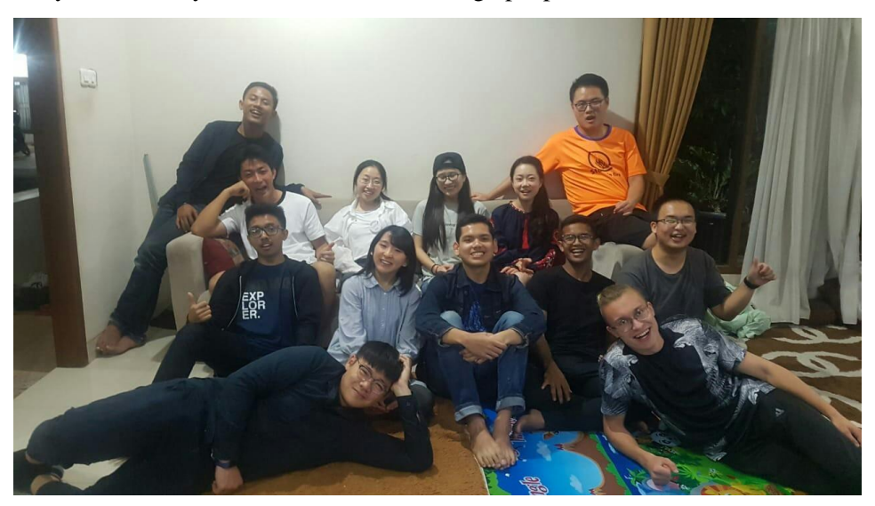
Figure 6 Home party at ITB student house

In free day, one ITB student hold a home party. In the party, he and his friends made Indonesian traditional foods. They were delicious for me. In the we talked about traditional foods in our home country. I explained "Ohagi". They had not eaten ohagi. If they come to Japan, I promise to treat Japanese traditional foods such as ohagi. In another topic, we talk with Japanese culture. ITB student shows their interest to Japan. I could not reply some questions about Japan. I learned it is important to understand my own country to make friend with foreign people.