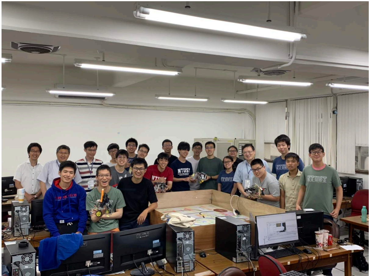
(participants and teaching staffs)

One of the most important things in this program is our friends from Taiwan tech. The program would not have been interesting and fun like this if they had not been there with us. Apart from the classes and projects, we always hung out and traveled together. We got along very well and I believe that our friendships will last even though the program has ended.