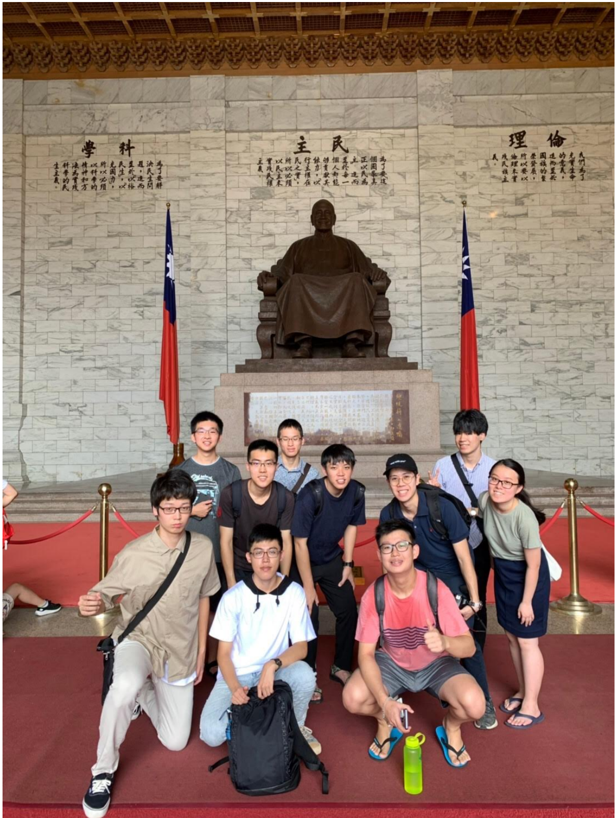
(traveling to Chiang Kai Shek Memorial Hall)