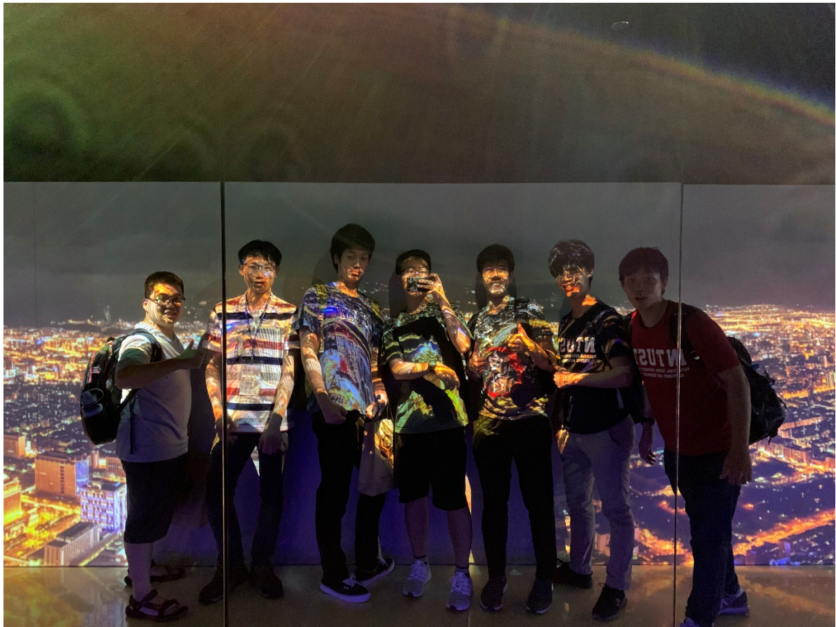
(Taipei 101 observation deck along with Tokyo tech and Taiwan Tech friends)

I enjoyed the program a lot in all aspects. The classes and project provided me new knowledge and its application, especially, about robotics which I am interested in. I also enjoyed my first-time travel experience in Taiwan along with new friends. I would like to say thank you to all the teaching staff from both universities, organizers who make this program happened.