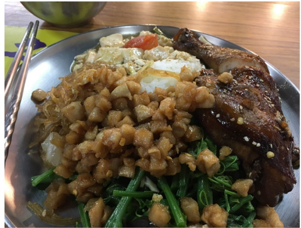
(Various kinds of food in Taiwan and university cafeteria)