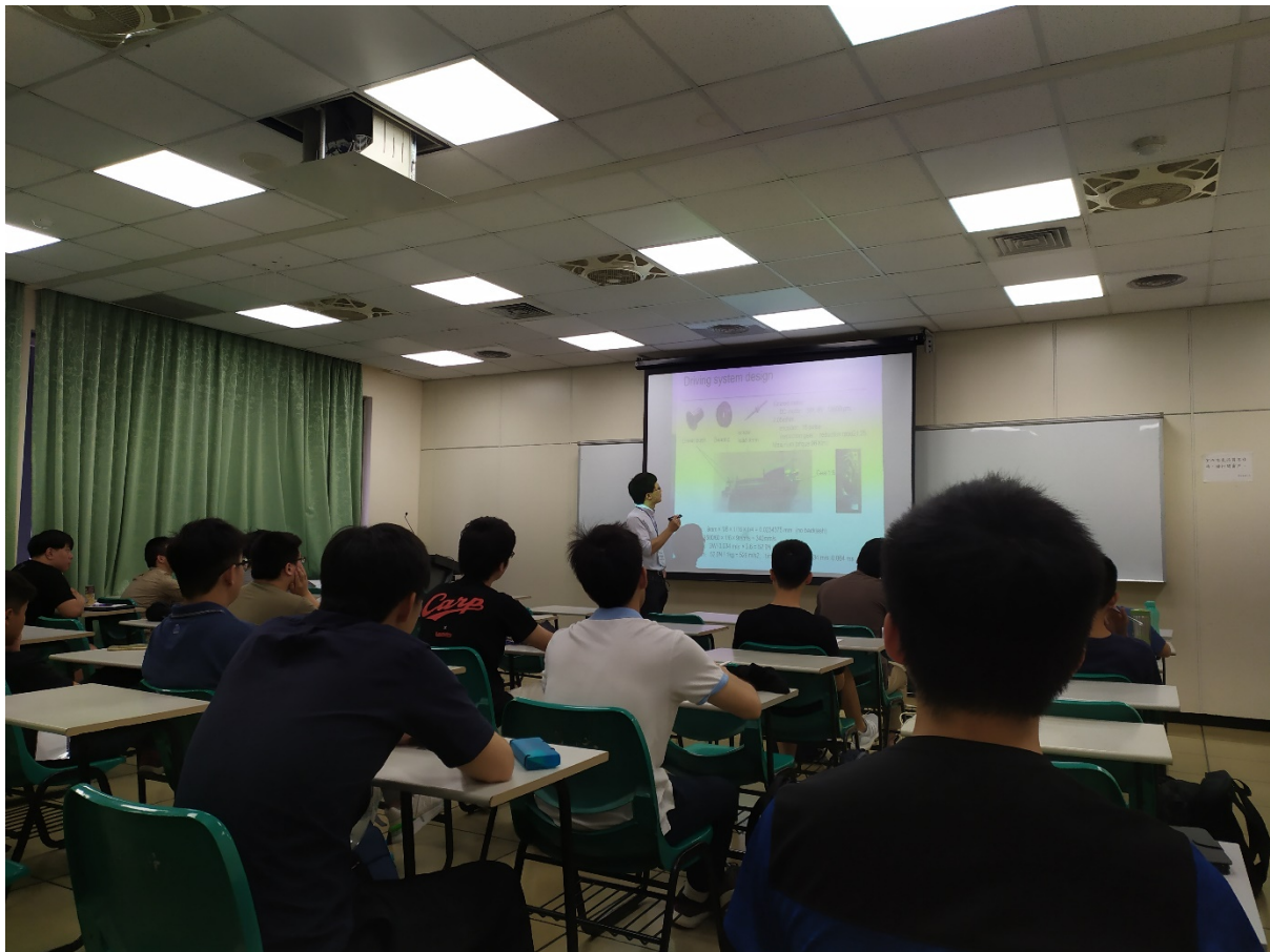
(Atmosphere in lecture classroom)

I participated in Capstone Design Project Course held by the cooperation of Tokyo Tech and Taiwan Tech (NTUST) this August. I, along with other seven Tokyo tech friends, spent our time in Taipei for three weeks with Taiwan tech classmates. In the first two weeks, we took classes from both Tokyo tech and Taiwan tech lecturers related to the theme of “AI city challenge”. The last week continued with a hands-on group project. We built a bipedal robot with a cart. The objective of the project is to achieve line tracking and path planning tasks by using those pieces of knowledge learned in the previous weeks. On the last day, each team competed with each other by some predefined rules.