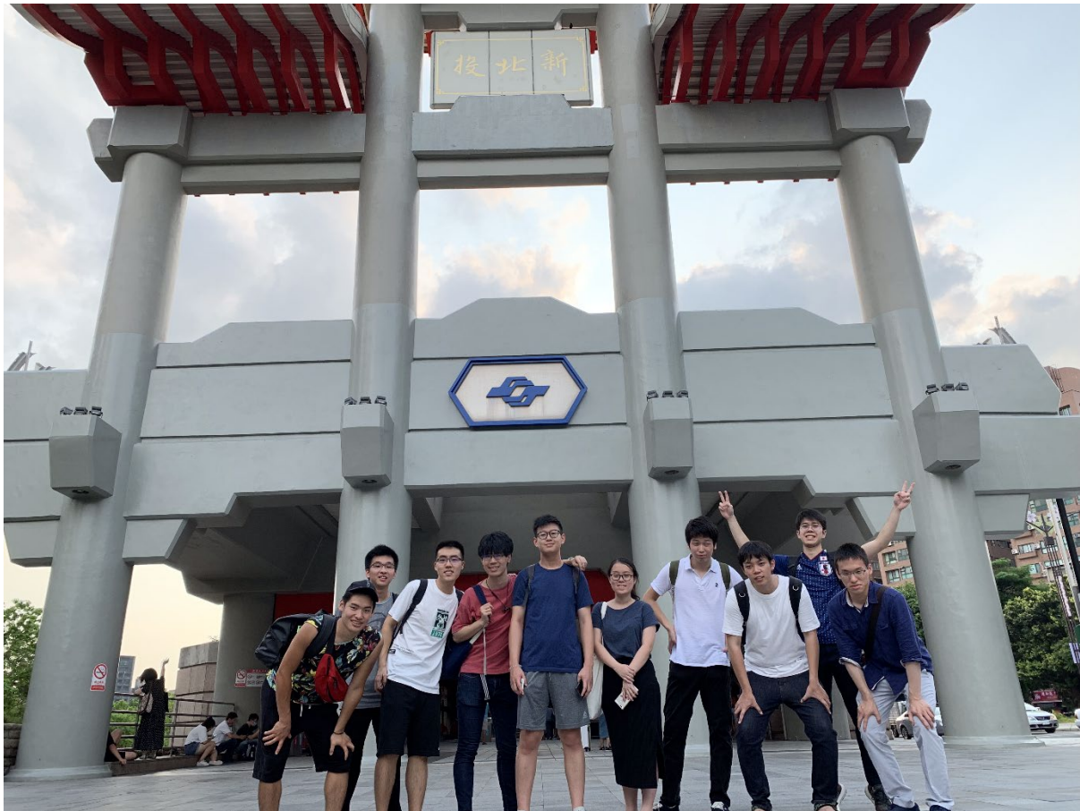
(traveling to Xinbeitou)

We also had an opportunity to listen to a speech from Kinik Company about its industry and engineering work. Also, we visited Kuozui Motor which manufactures cars for Toyota and other companies.