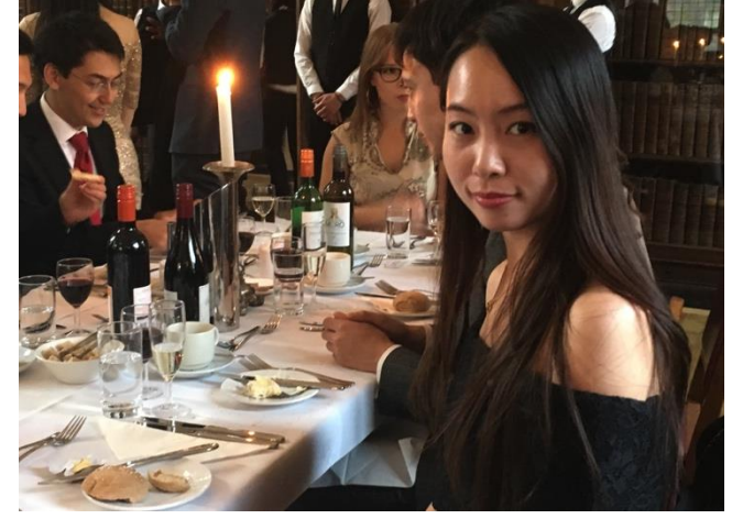
Formal dinner in Pembroke College