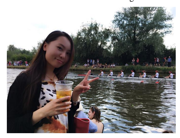
Cambridge May Bump