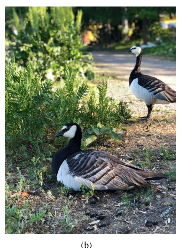
Figure 3 Picture from Travelling in Helsinki, Finland

As for my accommodation during my stay in RWTH Aachen, I have asked for some help from the Indonesian Student Association in Aachen since the accommodation provided from the university is fully booked by the time I arrived at Aachen. The accommodation in Germany was divided into numerous categories, such as WG (Wohngemeinschaft, Shared Accommodation), Einzelzimmer (One Bedroom Apartment), Schlafsaal (Dormitory), and etc. My accommodation was a WG with monthly rent of €240/month. This is just a rent fee, excluding the electricity, water, and gas fee. My roommates were all Indonesian with different reasons on coming to Aachen. Some of them were students at Fachschule Aachen, another university in Aachen.