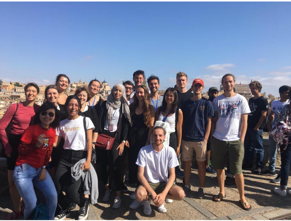
Trip in Toledo with classmates

About Spanish study, after the 3 weeks intensive course, I joined the regular language course in the university which is two times a week. The Spanish class is also one of the best part of the study there, very experienced teacher and very diverse classmates. In my class only I am from Asia, the rest of the classmates from the rest part of Europe. Not only study in the class we also went to the museum Prado, Reina Sofia and etc. But since I would like to learn more Spanish during my stay so that I went to find a language school outside the university. I didn't really like the first one and asked the advice of my Spanish teacher in the university and she recommended me another one which I really like and studied there for two months there.