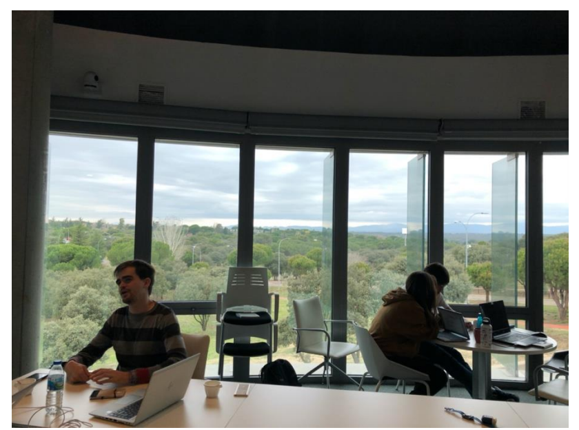
Classroom in Montegancedo Campus

Montegancedo Campus https://montegancedo.upm.es